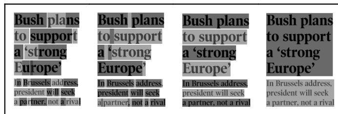
Fig. 3. Canonical text generation steps.

For concision purpose, the ten steps presented above have been simplified and adapted for western newspapers (Latin languages). Arabic and oriental languages are not currently taken into account. Our algorithm is effective with any text angle, since the merging occurs only in a specified layer at a time (text primitives with identical angles). The reading order is perfectly respected; indeed, we sort tokens, lines and blocks before each merging. A relevant feature of our system is its ability to generate the canonical format over any PDF file without specific customization. Indeed, thresholds are not static, they are generated by ratios of dynamic values (font size, interline, etc). Moreover, used ratios (thus thresholds) tend to be minimal, over-segmentation being preferable than under-segmentation.