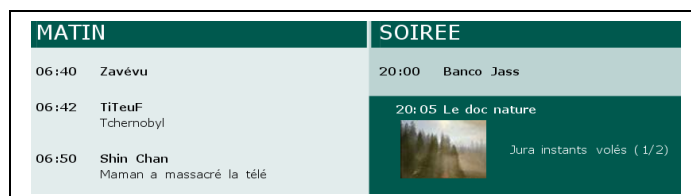
Fig. 4. Extract of TV schedule (September 21, 2005).

We finally got the XML logical structure corresponding to the previous DTD: